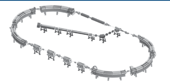
Best Particle Therapy 400 MeV ion Rapid Cycling Medical Synchrotron (iRCMS).