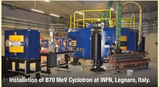
Installation of B70 MeV Cyclotron at INFN, Legnaro, Italy.