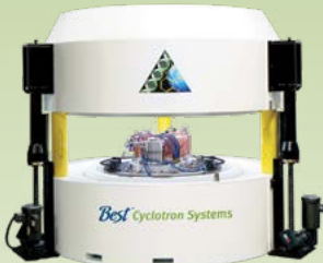
Best B 100p, BG 95p and B 11p Sub-Compact Self-Shielded Cyclotron w/Optional Second Chemistry Module