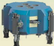
Best Model B35ADP Alpha/Deuteron/Proton Cyclotron