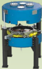
Best Model 6-15 MeV Compact High Current/Variable Energy Proton Cyclotron