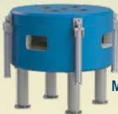
Best Model B25p Cyclotron