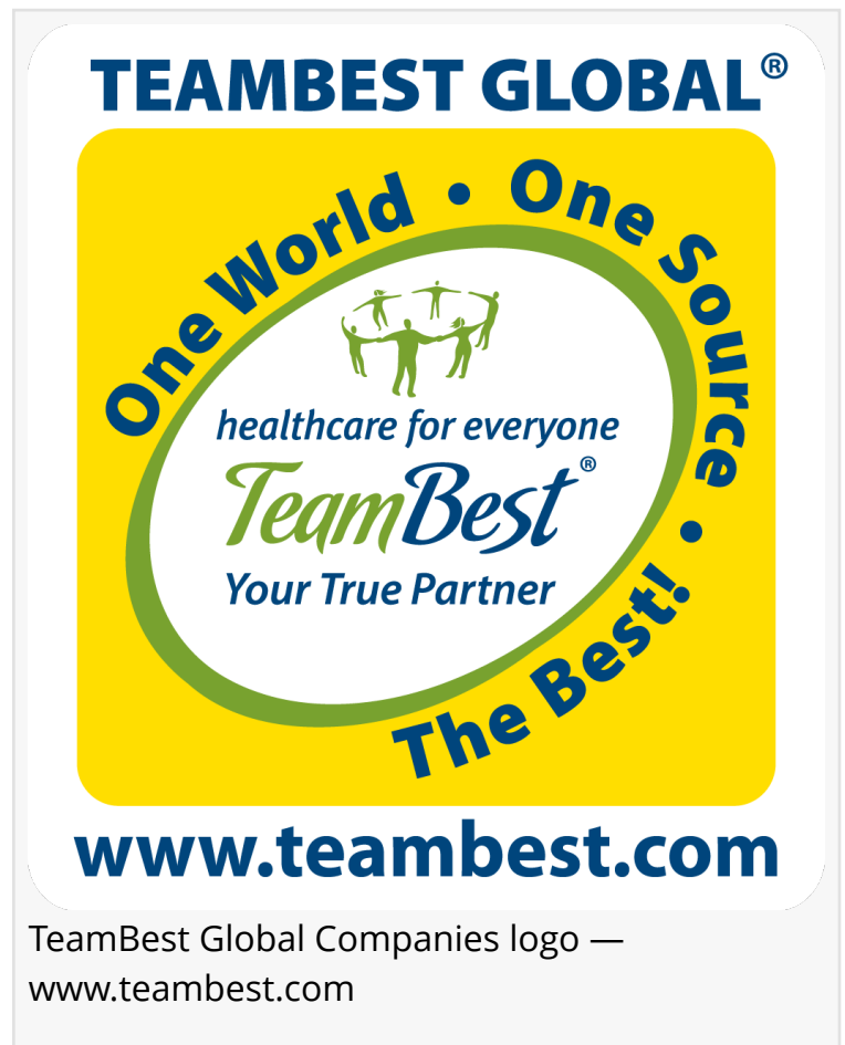
TeamBest Global Companies logo — www.teambest.com