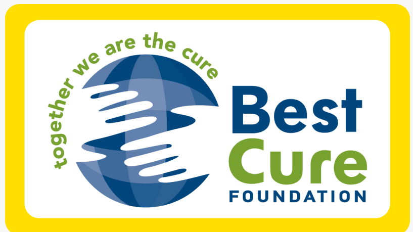
Best Cure Foundation — www.bestcure.md